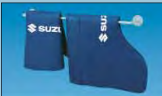
wall bracket for more tidiness O/N D-H 99