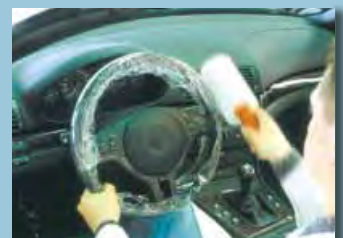
steering wheel and gear shift protection adhesive foil with handle O/N D-L 42