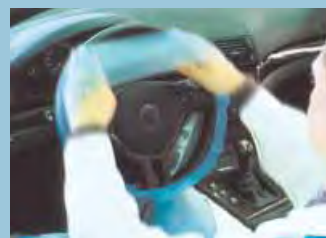
steering wheel cover ring shape, elastic, blue O/N D-L 18