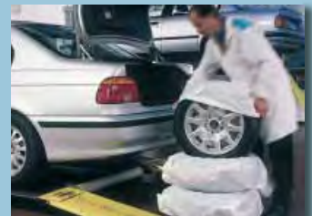
tyre sacks XXL: O/N D-R 156 XL: O/N D-R 155