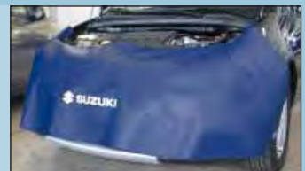
front cover SUZUKI O/N D-Z 65-01