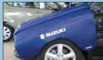
fender cover SUZUKI O/N D-Z 65