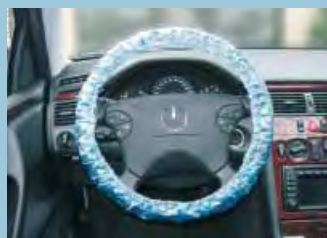
steering wheel cover for passengers cars, elasticated, blue O/N D-L 30