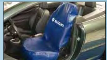
seat cover SUZUKI O/N D-S 15 Z