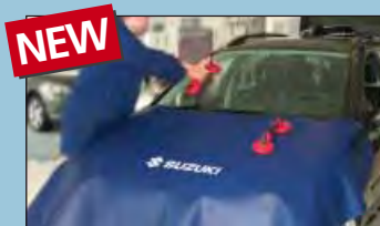
bonnet cover SUZUKI O/N D-Z 65-05

Recommended by leading car manufacturers.