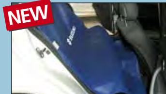
back seat bench protection SUZUKI O/N D-S 16 Z

Recommended by leading car manufacturers.