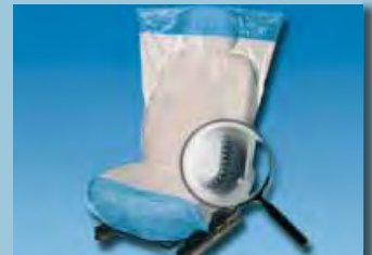
seat cover “Optifit” “anti slip bottom”, white and blue O/N D-E 2000