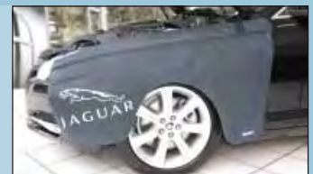
fender cover JAGUAR O/N D-JA 140