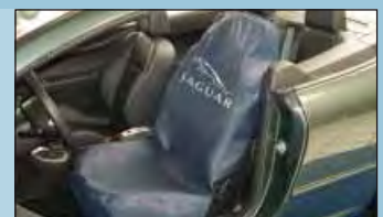
seat cover JAGUAR O/N D-S 15 JA