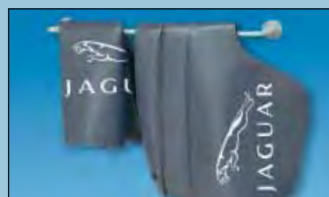
wall bracket for more tidiness O/N D-H 99

Recommended by leading car manufacturers