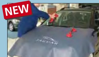
bonnet cover JAGUAR O/N D-JA 140-05

Recommended by leading car manufacturers