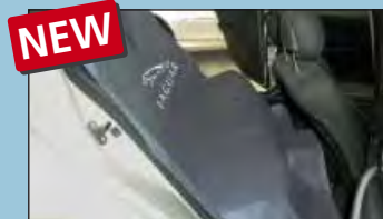
back seat bench protection JAGUAR O/N D-S 16 JA