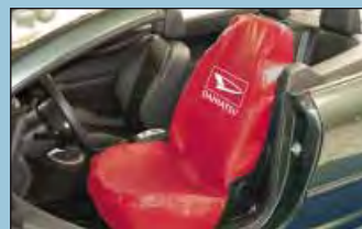
seat cover Daihatsu O/N D-S 15 DD

DATEX protection covers for workshops are recommended by Daihatsu Deutschland GmbH