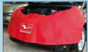
front cover Daihatsu O/N D-D75-01

DATEX protection covers for workshops are recommended by Daihatsu Deutschland GmbH