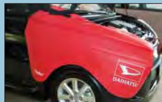
fender cover Daihatsu O/N D-D 75