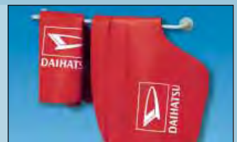
wall bracket for more tidiness O/N D-H 99